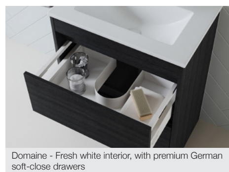
Domaine - Fresh white interior, with premium German soft-close drawers

To see the complete Domaine range go to www.reece.co.nz