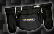
BUTE TOOL BELT BTB10 - Designed to fit your Butte ProClamp tools, Butte fittings, tape measure, hammer, pencil and ruler.