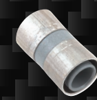
INLINE COUPLING S28 - 28mm x 28mm