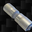
INLINE COUPLING S12 - 12mm x 12mm