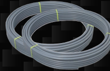
LAV FLAT PB-1 PIPE COILS BSC18 - 6 x 18mm x 10m Lengths BSC22 - 6 x 22mm x 10m Lengths