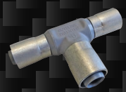
REDUCING TEES TR001 - 12mm x 12mm x 15mm TR002 - 12mm x 12mm x 20mm TR110 - 15mm x 15mm x 12mm TR220 - 20mm x 20mm x 12mm