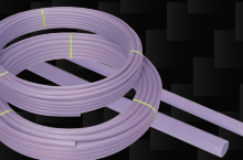
GREY WATER / RECYCLED WATER PB-1 PIPE BCR18 - 18mm x 50m Coil BCR22 - 22mm x 50m Coil BLR18 - 18mm x 5m Lengths BLR22 - 22mm x 5m Lengths