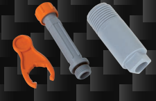
EXTENDED TEST PLUG BP15 - 1/2" BSP Test Plug with self sealing drain cap. TEST PLUG PH15 - 1/2" BSPT