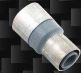
REDUCING COUPLING S2820 - 28mm x 20mm