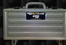
BUTE FITTINGS CASES BUTEFC12 - A smaller fittings case with a selection of Bute 12mm fittings. BUTEC12 - This smaller fittings case is also available empty.