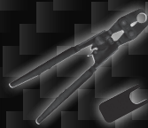
QUICKCLAMP MINI TOOL QC20 - 15mm Includes checking gauge.