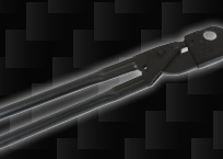
CLAMP TOOLS FR20 - 15mm FR25 - 20mm