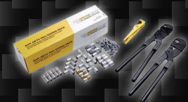
BUTE GETS YOU GOING PACK GG01 - 2 clamp tools (15mm & 20mm), a pipe cutter, and a selection of the most popular fittings.