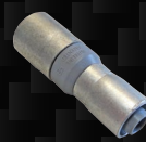
REDUCING COUPLINGS S1512 - 15mm x 12mm S2012 - 20mm x 12mm