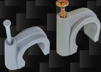
NAIL / METAL SCREW PIPE CLIPS Nail Metal Screw BA18 - 18mm BAS18 - 18mm BA22 - 22mm BAS22 - 22mm