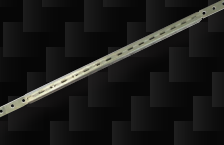
BUTE-1 TELESCOPIC NOG BRACKET Telescopic galvanized steel bracket supports BUTE-1. Ideal for timber or steel frame projects. BK2 - 330mm to 610mm