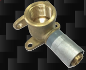
DOUBLE FIX FEMALE WING BACK ELBOW WED15 - 1/2" BSP x 15mm