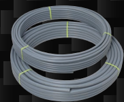
PB-1 PIPE COILS BC12 - 12mm x 25m Coil BC12100 - 12mm x 100m Coil