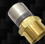
BRASS MALE ADAPTOR M2028B - 3/4" BSP x 28mm M28B - 1" BSP x 28mm