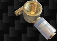
TOP FIX FEMALE WING BACK ELBOWS WET15 - 1/2" BSP x 15mm WET20 - 3/4" BSP x 20mm