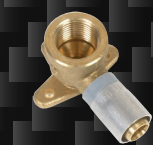
FEMALE WING BACK ELBOWS WE15 - 1/2" BSP x 15mm WE20 - 3/4" BSP x 20mm WE2015 - 3/4" BSP x 15mm