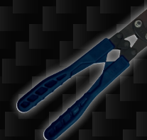
CLAMP TOOL FR28 - 28mm