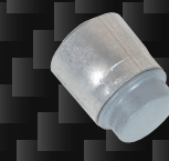
PIPE END PLUGS PG15 - 15mm PG20 - 20mm