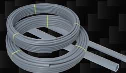
PB-1 PIPE BC18 - 18mm x 50m Coil BC22 - 22mm x 50m Coil BL18 - 18mm x 5m Lengths BL22 - 22mm x 5m Lengths