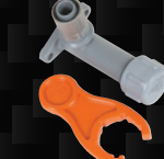
LUGGED ELBOWS BLE70 - 1/2" BSPT x 15mm x 70mm BLE100 - 1/2" BSPT x 15mm x 100mm Includes test cap and spanner.