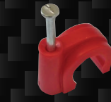
PIPE CLIPS FOR HOT WATER LINE BAR18 - 18mm BAR22 - 22mm