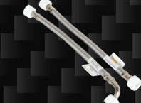
FLEXI HOSES 1/2" BSP x 1/2" BSP x 300mm FPE300 - Elbow Flexi Hose, Butte Nuts FPS300 - Straight Flexi Hose, Butte Nuts