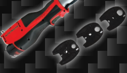
ELECTRIC CLAMP TOOL & JAWS ET01 - Boxed kit includes tool with battery, charger and a set of 3 jaws (as below). ETJ18 - 15mm jaws ETJ22 - 20mm jaws ETJ28 - 28mm jaws Jaws for the electric tool are also available individually for purchase.