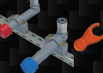
BUTE-1 Adjustable 1/2" BSP Male Wall Elbow BUTE1 - 1/2" BSP x 15mm x 70mm BUTE1EX - 1/2" BSP x 15mm x 100mm Includes telescopic steel brackets, test caps (hot & cold) and palm spanner.