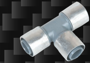
EQUAL TEES T15 - 15mm x 15mm x 15mm T20 - 20mm x 20mm x 20mm