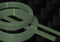
RAINWATER PB-1 PIPE BCC18 - 18mm x 50m Coil BCC22 - 22mm x 50m Coil BLG18 - 18mm x 5m Lengths BLG22 - 22mm x 5m Lengths