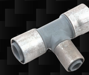
REDUCING TEES TR882 - 28mm x 28mm x 20mm TR822 - 28mm x 20mm x 20mm TR828 - 28mm x 20mm x 28mm TR881 - 28mm x 28mm x 15mm