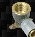
FEMALE WING BACK ELBOW WE28 - 1" BSP x 28mm