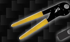
PROCLAMP TOOLS PRO18 - 15mm PRO22 - 20mm Includes checking gauge.