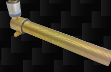
TOP FIX MALE WING BACK ELBOWS WMT215 - 1/2" BSP x 15mm x 200mm WMT220 - 3/4" BSP x 20mm x 200mm