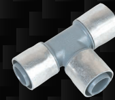
EQUAL TEE T28 - 28mm x 28mm x 28mm