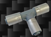
EQUAL TEE T12 - 12mm x 12mm x 12mm