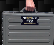
BUTE FITTINGS CASES BUTEFC - A quality fittings case with Buteline product (pictured). BUTEC - This tough and durable tradesman's case is also available empty.