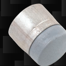
PIPE END PLUG PG28 - 28mm