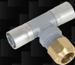
COPPER TO PB PIPE TEE TK15 - 15mm x 15mm x 1/2" BSPT to fit 15mm copper