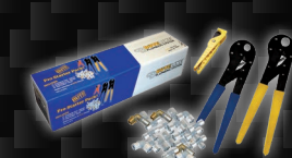
BUTE PRO STARTER PACK BPP10 - 2 ProClamp Tools (15mm & 20mm), a pipe cutter, and a selection of useful fittings.