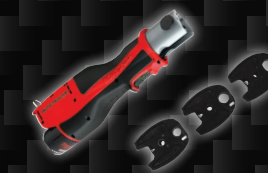
ELECTRIC CLAMP TOOL & JAWS ET01 - Boxed kit includes tool with battery, charger and a set of 3 jaws (as below). ET18 - 15mm jaws ETJ22 - 20mm jaws ETJ28 - 28mm jaws

Jaws for the electric tool are also available individually for purchase.