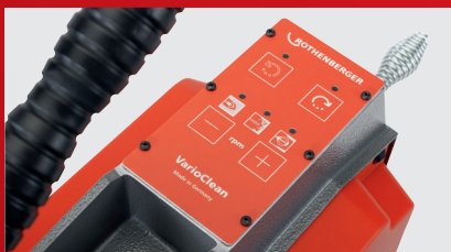
Optimum adjustment options for unblocking - cleaning - clean spinning