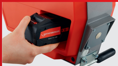
Plug-free 18V Power with the CAS-battery system