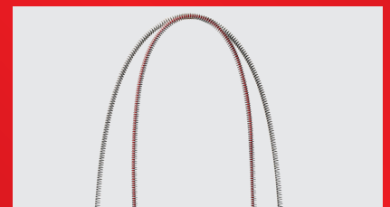
DuraFlex spiral: lighter, better archwalking - long service life due to galvanisation