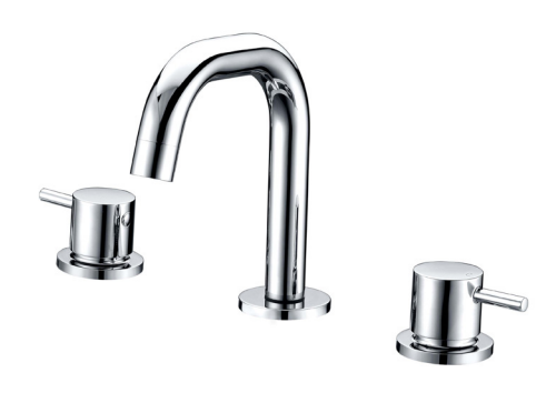
To see the complete Mizu range go to www.reece.com.au/bathrooms