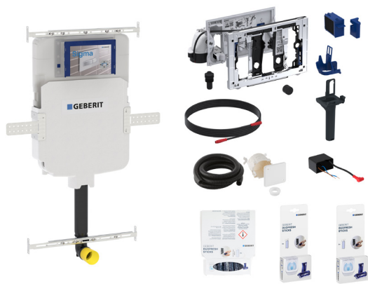
1804982 Geberit Sigma8 Back to Wall Cistern with DuoFresh