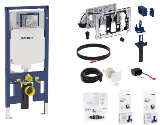
1804983 Geberit Sigma8 Wall Hung Cistern with DuoFresh

Dimensions are nominal measurements only.