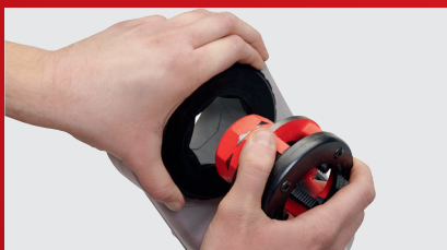
Easy insertion of the die head with tension locking ring