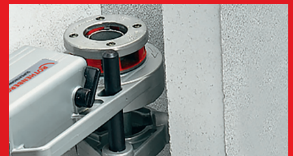
Work in confined spaces