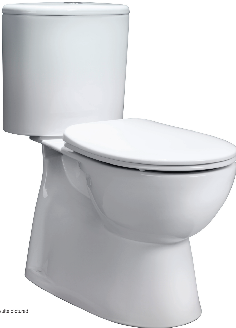
S trap suite pictured