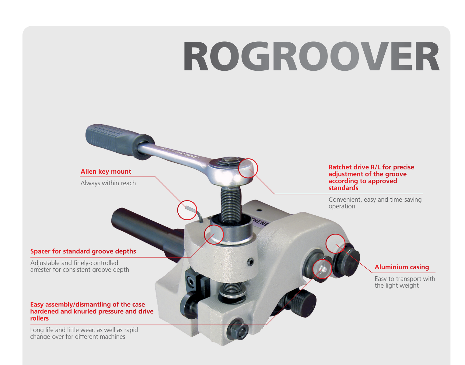
Professional application with threader for the production of grooves