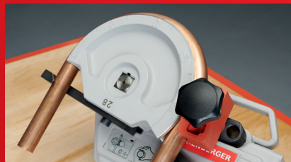
Forged aluminium segments with bending angle scale