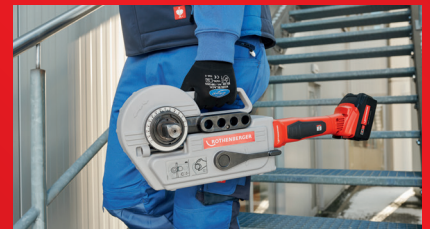
Comfortable carrying handle