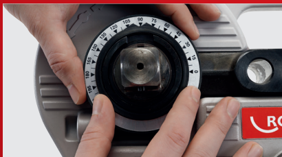
Pre-adjustment of the bending angle without tools