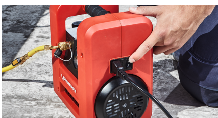
Removable cable and power button for convenient starting procedure