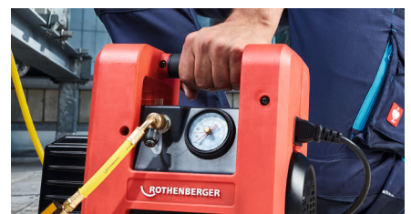
Ergonomic handle for easy transport