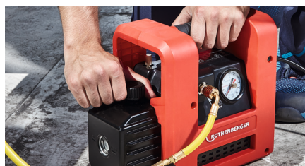
Special filter for reducing oil mist on exhaust vent