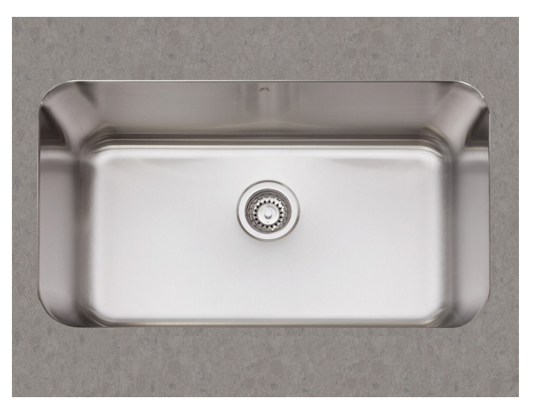
Sinks must be installed using a cutout template. No responsibility will be taken for damage that occurs where a template has not been used.