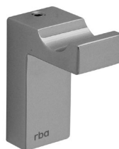
ënda Robe Hook #3