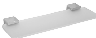
ënda Acrylic Shelf to AS1428.1-2009