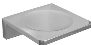
ënda Soap Dish