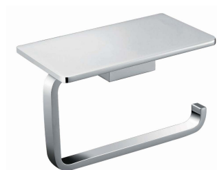
ënda Toilet Roll Holder #2