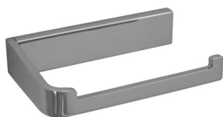
ënda Toilet Roll Holder #1