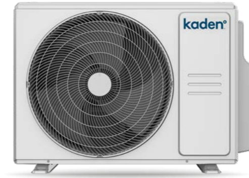
KM24 OUTDOOR UNIT