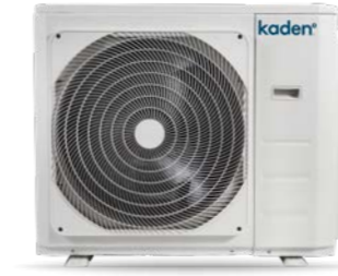
KM28/KM46/KM48 OUTDOOR UNIT