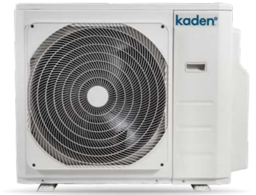
KM28/KM36 OUTDOOR UNIT