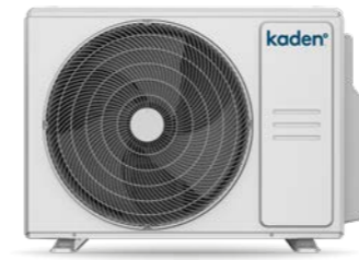
KM18/KM24 OUTDOOR UNIT