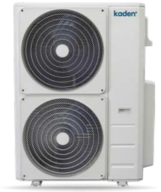
KM60 OUTDOOR UNIT