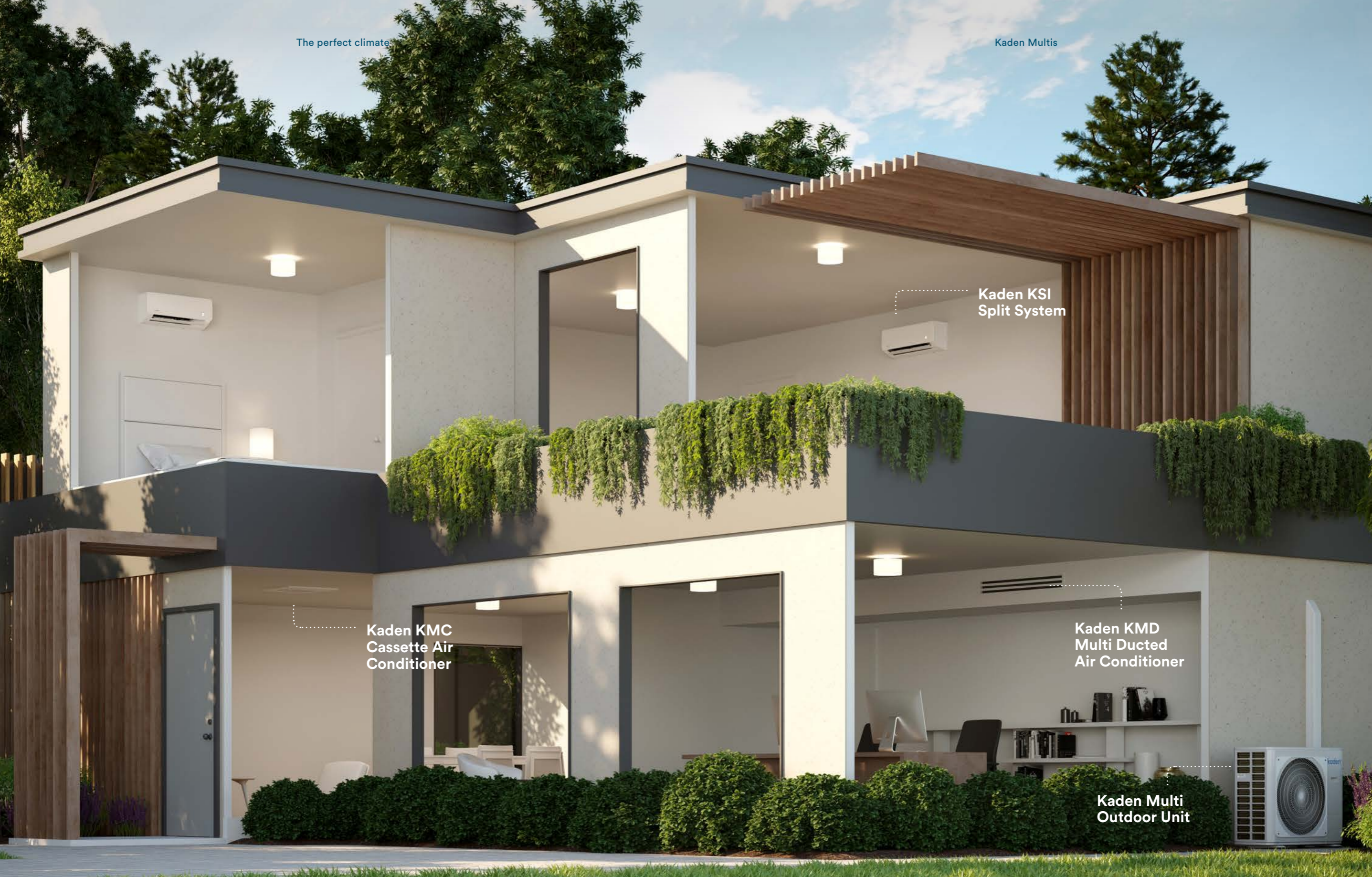
Kaden KSI Split System