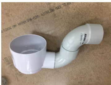
Below floor smart trap