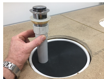
Waste pipe into smart seal

2. Timber floor with clear access underneath: