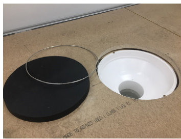
Below floor smart pan