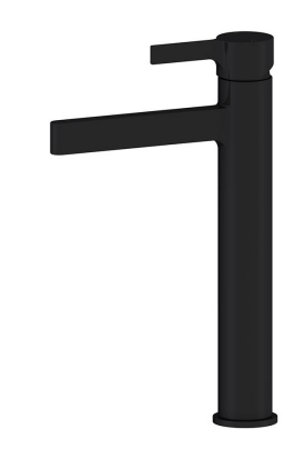
To see the complete MIZU range go to www.reece.com.au/bathrooms