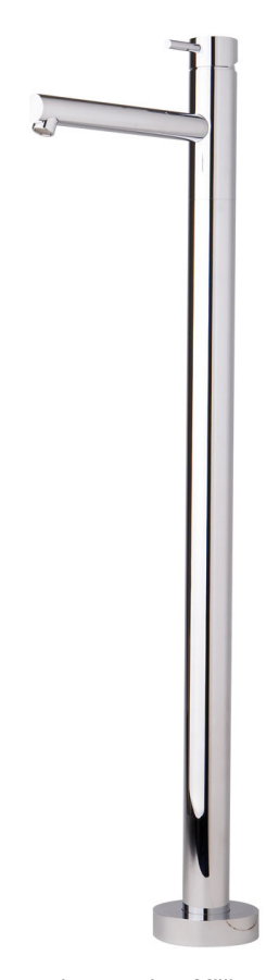
To see the complete Milli range go to <u>www.reece.com.au/bathrooms</u>

Dimensions are nominal measurements only.