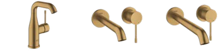
Essence New Basin Mixer WELS 5 Star, 6ltrs/min

Brushed Nickel Hard Graphite Brushed Cool Sunrise