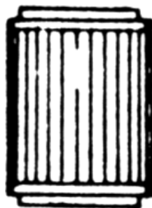
Cartridge 4495/C - 4496/C

Every cartridge is supplied with spare Gasket "B".