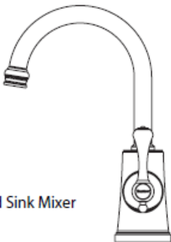
Basin and Sink Mixer

Remove the grub screw in the lever handle and lift off the handle. Unscrew the dome cap and the lock nut. Lift out the old cartridge and clean inside the outer casing. Insert new cartridge ensuring the lungs on the bottom of the cartridge line up with the holes in the mixer main body. Assemble fixing nut (tighten with a spanner), the dome cap and the handle securely.