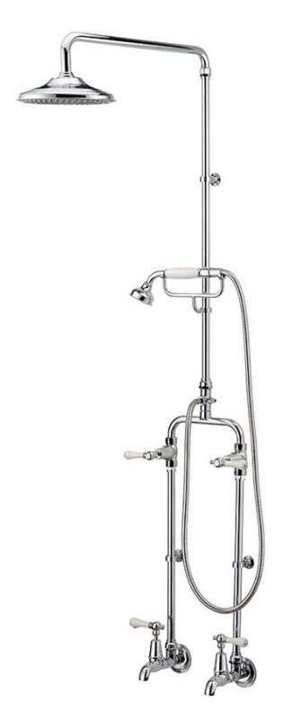
To see the complete KADO range go to www.reece.com.au/bathrooms