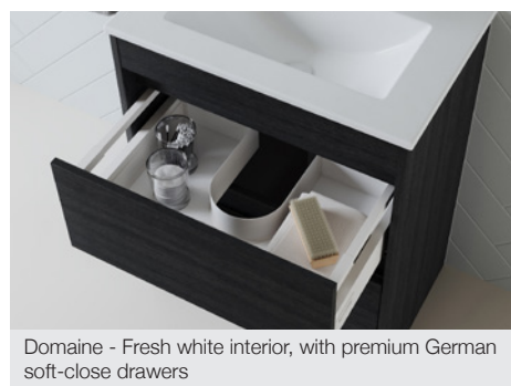
Domaine - Fresh white interior, with premium German soft-close drawers

To see the complete Domaine range go to www.reece.co.nz