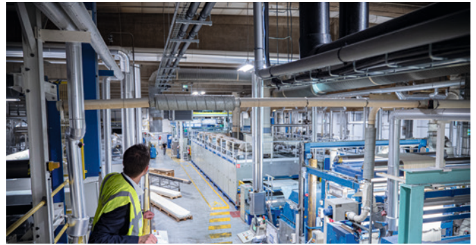
The COOL-FIT piping systems could be installed without interrupting mask production.

Thanks to the continuous support of GF Piping Systems, SENFA was able to focus on its day-to-day business and mask production – of national interest. From May to October 2020, 60 million fabric masks have already been made. By allowing fabric mask production to run without interruption and relying on the COOL-FIT piping system, SENFA can now focus on the production of other types of masks.