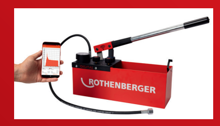
Digital pressure sensor enables precise adjustment of the test pressure