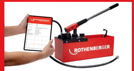
Creation of a test protocol via app