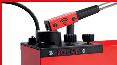
Wireless readout of the test data via Bluetooth®