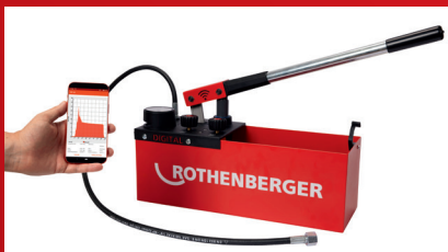
Digital pressure sensor enables precise adjustment of the test pressure