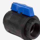
Guyco Ball Valves