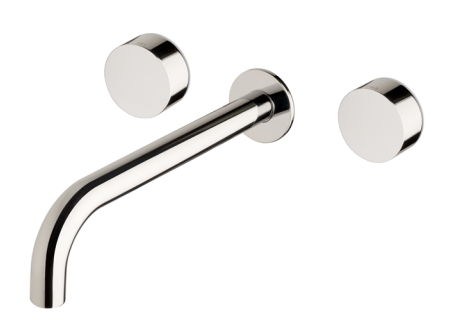
To see the complete MILLI range go to www.reece.com.au/bathrooms