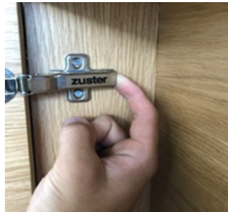
1. Pull tag off