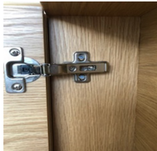
1. Loosen the 2 screws on each side and lift door up and down, re-tighten screws.