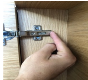
2. Push down clip and remove door