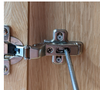
2. Turn left to right for depth adjustment