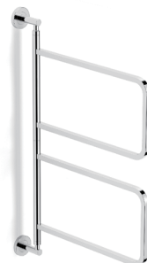
Milli Axon Multi Towel Rail Swivel Small

Please refer to Warranty Page for full Terms and Conditions