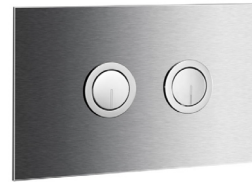
Round Button (Inwall) 232 x 148mm