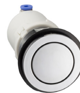
Round Remote Access Buttons Only* 46mm diameter

Backing plate available in polished stainless steel, brushed stainless steel, black glass or white glass