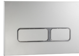
Rectangle Button (Inwall) 232 x 148mm

Available in chrome, silver, black or white.