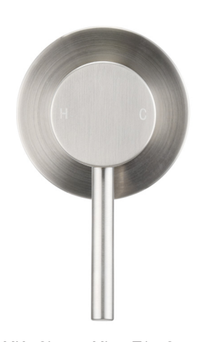
The Mizu MK2 Shower Mixer Trim Set allows you to install the Universal Inwall Body at installation rough-in stage, then leave the tapware trim set colour choice for later.