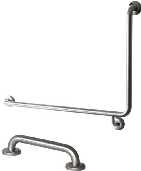
*Left Handing image shown above and below.